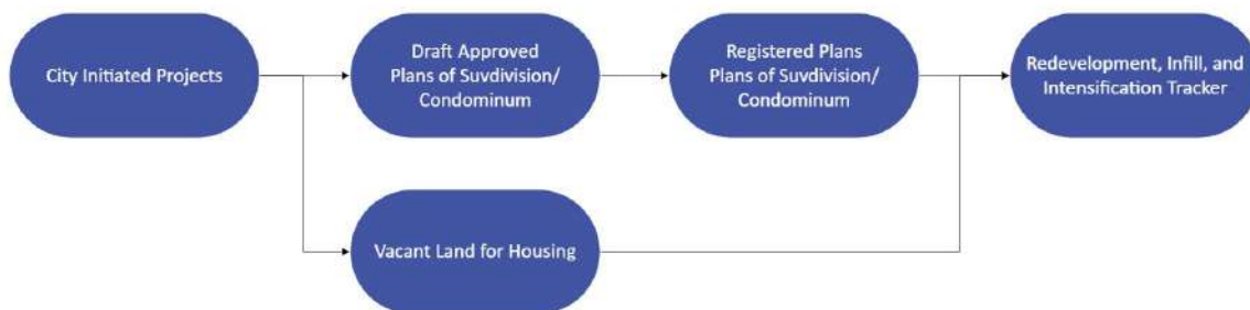
Figure 1: Housing Supply Tracking

The review finds that at the end of December 2024 there were: