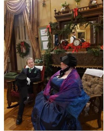
Left to Right: CCI site visit to Glanmore, quilt exhibition, actors from "Live History" performance