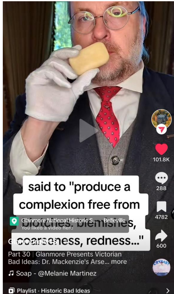
Above: Glanmore's popular TikTok account