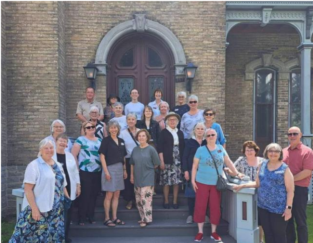
Above: 2024 Volunteer Appreciation event