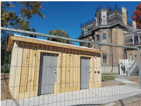
Above: Construction underway for accessible washroom project